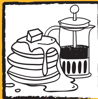
Host a breakfast at your work