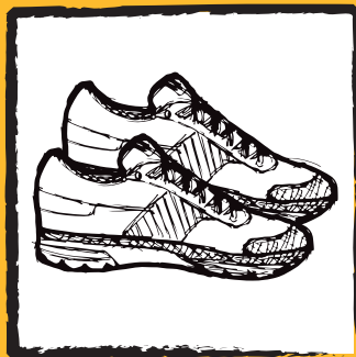
Raise funds at our next fun run or walk