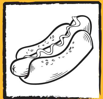
Hold a sausage sizzle